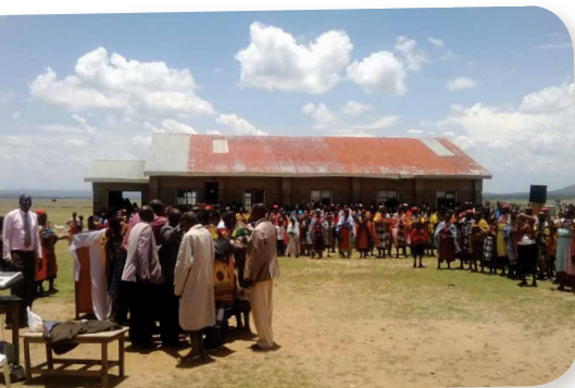
Church building dedication.

worked through a variety of circumstances, times of prayer and fasting, and conversation with people. Not an easy decision. Kenya is where we gave the prime years of our lives, where we raised our family with a lot of moving around between worlds and people, where we built wonderful relationships and memories in places we did call home. Did it all make sense to leave at this time in life or in development of ministry? Not completely, and we thought it will require just as much faith, if not more, to return to America than it did to come to Africa in the first place. What will we go to – where will we go? But we kept moving forward.